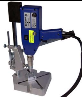
Drader Injectiweld in a stand for Injection Moulding.

The stand helps you to make more products in shorter time.