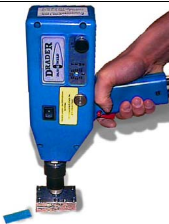
Hand held Injection Moulding.

Injection moulding with the Drader Injectiweld can be made handheld. We train your personal and consult in questions of mould design. Do not hesitate to contact us for samples and requests for demonstrations.